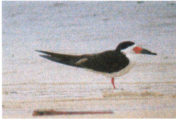
Black Skimmer beach at Shawnee SP 9/19/03